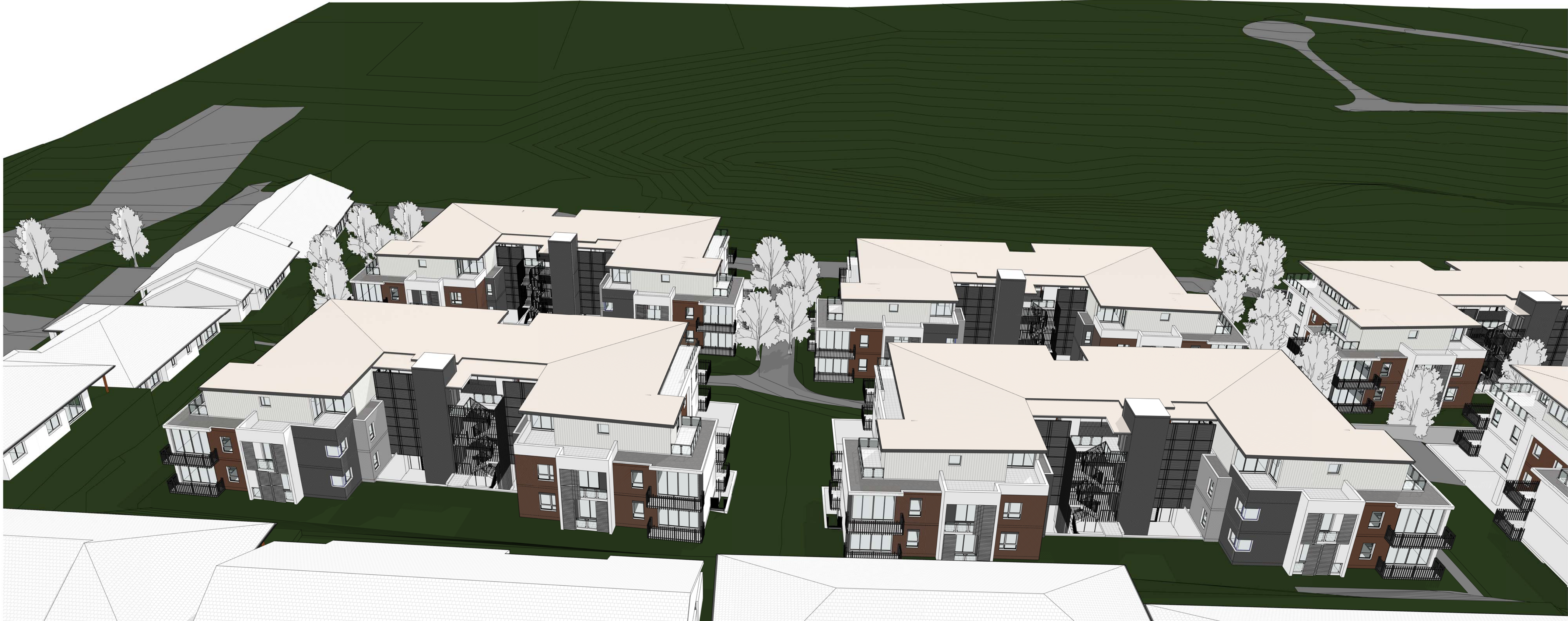
1 3D View 7 Copy 2