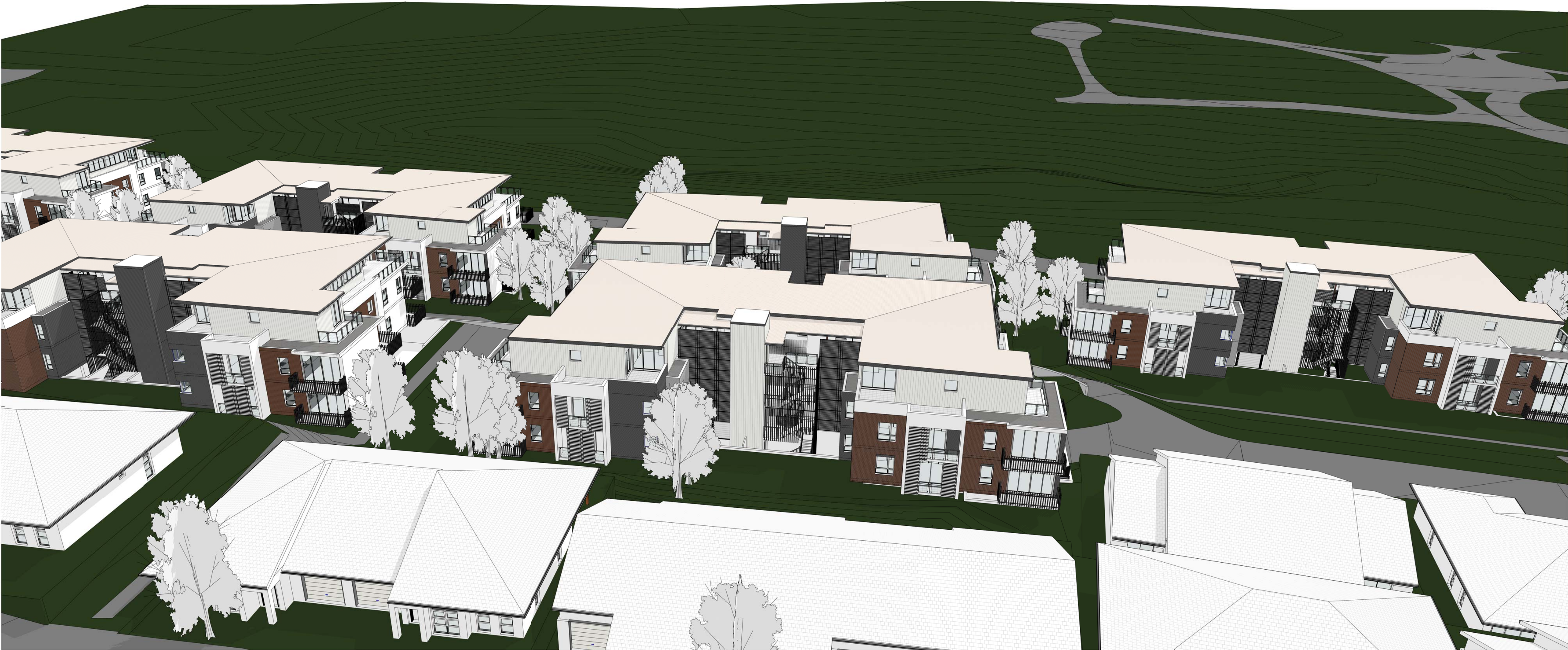
1 3D View 7 Copy 2 Copy 1