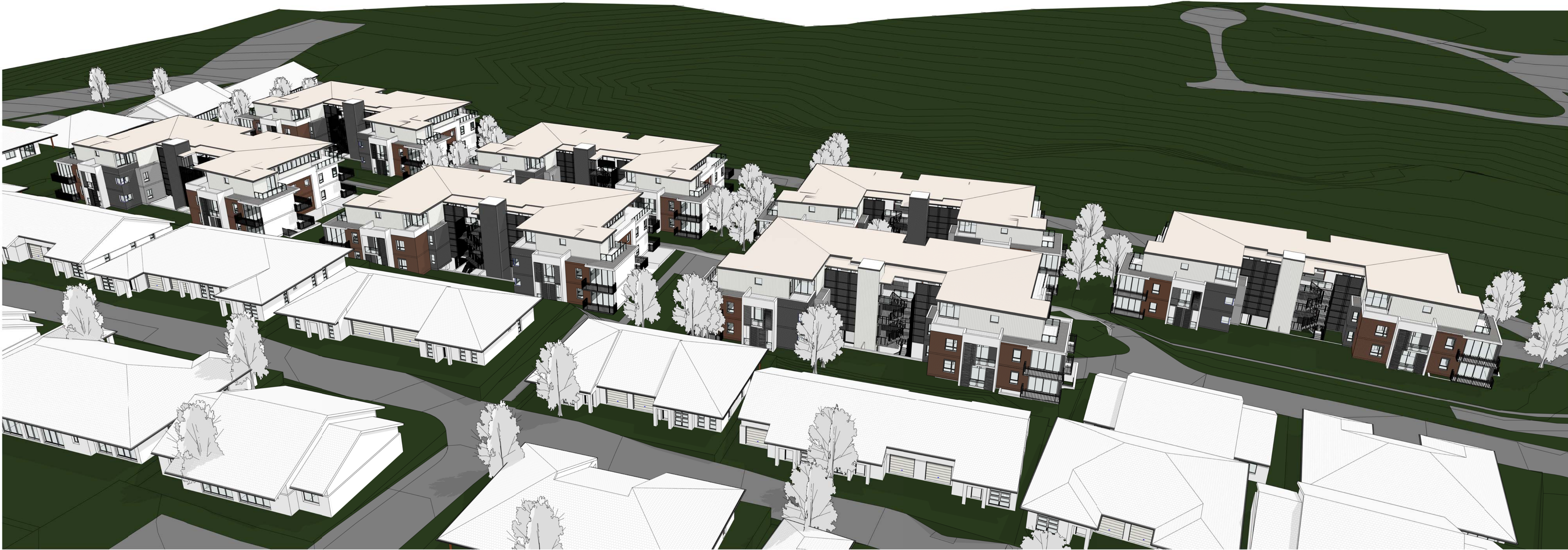
1 3D View 7